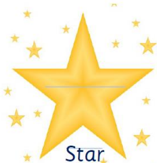
Star of the Week