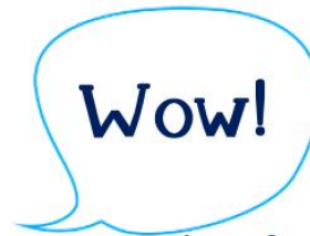
words of celebration